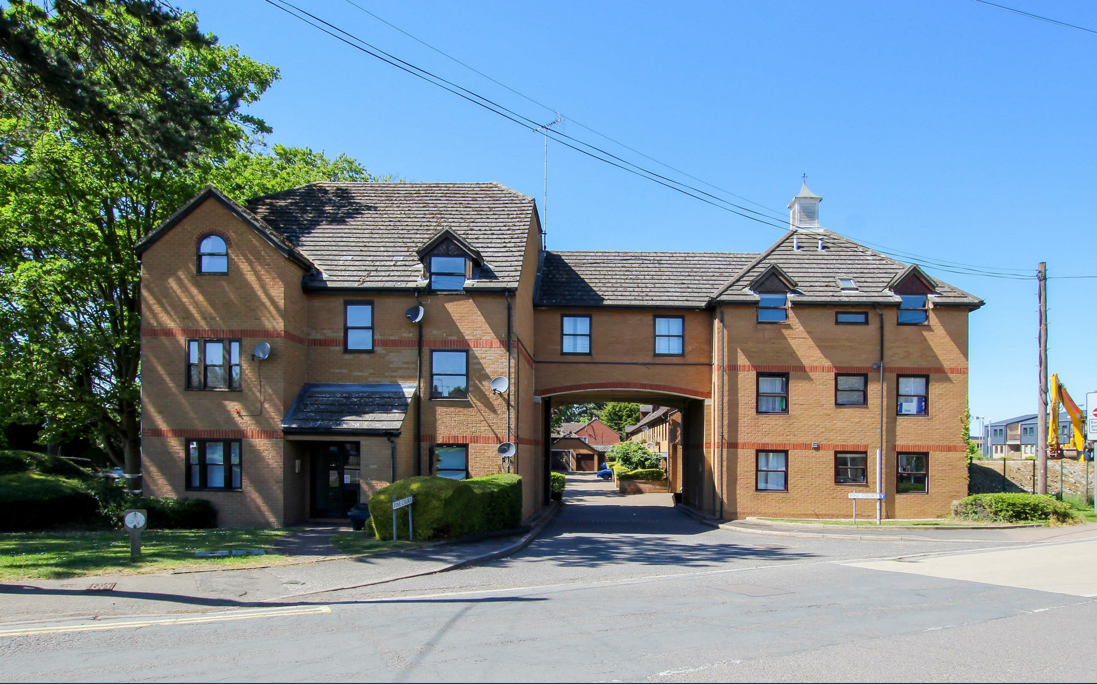
Pine Court, Impington, Cambridge, CB24 9ZT